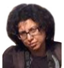
Kanika Bansal Photographer