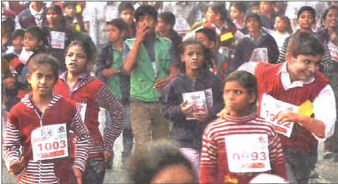
बाल दिवस के अवसर पर चाणक्यपुरी में आयोजित रियल रन फ़र चिल्ड्रेन दौड़ में भाग लेते बच्चे।