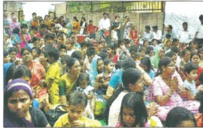
Campaign addresses issue of skewed sex ratio.